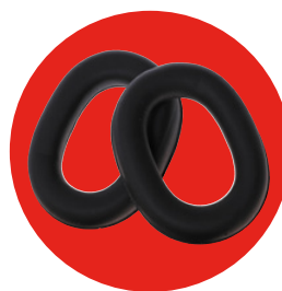
SONORA SPARE 8300